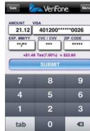
Card Swipe Entry